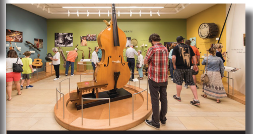
Musical Instrument Museum (MIM) https://www.mim.org