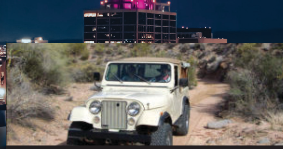
Jeep Tours (local) https://www.wildwestjeeptours.com