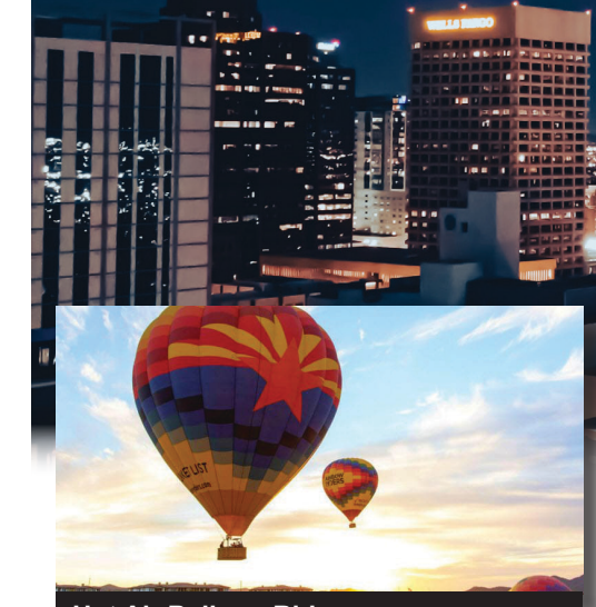
Hot Air Balloon Rides https://www.rainbowryders.com